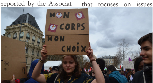
Women attend an abortion rights protest in Paris.

was illuminated with the message: "My body, My choice." Al Jazeera says that "...Macron last year pledged to protect reproductive rights better after the United States Supreme Court in 2022 overturned the half-century-old right to the procedure, leaving it up to individual states to decide." It is said the French were influenced by the former Yugoslavia who had "a person is free to decide on having children" explicitly protected in its constitution, furthers the Associated Press. Also