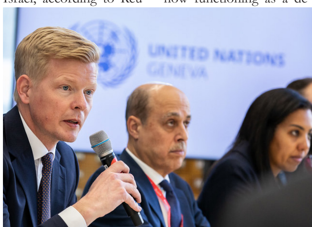
Hans Grundberg speaks to delegates at the Palace of Nations to negotiate the Detainee Exchange Agreement.

Despite the Houthclaims that they act in the interest of their people, experts highlight significant flaws in their argument. The Houthis, now functioning as a de