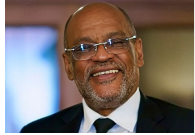
Former Haitian PM replaced by gang leader Jimmy Chérizier.

The increase in gang violence also has led