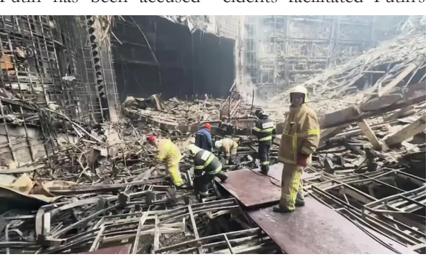
Crocus City Concert Hall following terrorist attack.

"false-flag" operations against his people. In 1999, deadly bombings in multiple apartment buildings enabled Putin to reign in enough power to propel him to the presidency, says Radio Free Europe. The bombings, resulting in over 300 fatalities, were attributed to militants from Arab countries and Chechnyan dissenters against Russian authority. These incidents facilitated Putin's