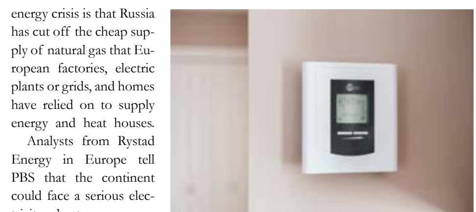
Heating with a home thermostat will be extremely expensive in