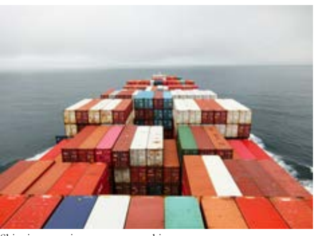
Shipping containers on a cargo ship.

Because of the recent Turkish cargo as "mov- Greek officials wrote let- Greek attack, UN officials ters to the UN pleading are concerned about the potential for another open conflict in Europe in light of the already destabilizing conflict in Ukraine. Gre- between the two countries yet evidence presented in behavior involving such co-Turkish relations have soured over the past few disputes over claims in the decades because of mari- Eastern Mediterranean, as base of the Aegean Sea situations. According to time border disputes, but well as much of the Aegethe ship's cabin windows Reuters, Greece's Foreign tensions have been espe- an Sea, while Greece re- to the large population cially high in recent years jects accusations that there of Greeks that live there, rified reactions. Turkish as, acknowledged that due to accusations of air is ongoing militarization the behavior of Turkey, a space violations from both of the islands that border to the area, but before NATO member, risked a sides. According to The the Turkish coast. Accordsituation similar to the one Washington Post, Turkish ing to Al Jazeera, Hasan currently unfolding with officials say that Greek Gogus, former Turkish the war in Ukraine. De- forces have been targeting ambassador to Greece the Aegean Sea near the spite aggressive rhetoric their fleets and jets during and Austria says that Tur-Mediterranean, while the eral disputes regarding the One. However, on July