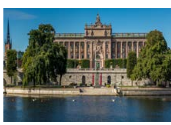
Swedish parliament.

Another key issue for For many, the Swe- voters is gang violence. den Democrats' rise to Many citizens have felt a reports The New York power is a concerning loss of security as a result Times. Though the Swed- development. Previous of the country's uptick in shootings, which have Party obtained the largest na Andersson points out left 48 people dead this year from firearms. Time clarifies that the country has jumped up the list of the most crime-infested European countries, with citizens particularly worried about gang-infested neighborhoods. Reuters reports that 41 percent of Swedish voters identify crime as their biggest concern for election issues. Sweden's Social Democrats have tried to tackle the issue by prioritizing fixing the welfare state in 25 percent. The Social erate Party. Despite the years ago, right-wing par- den Democrats, despite an attempt to stop peo- Democrats are commit- Sweden Democrats' poties refused to cooperate being in opposition to the ple from joining gangs. ted to hydro, solar, and litical gains, the existing