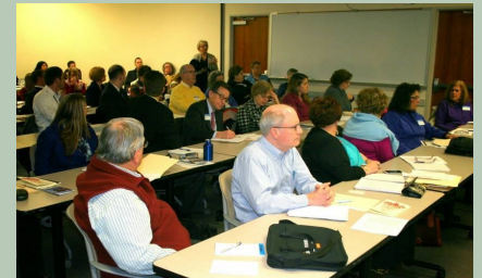
Participating New Jersey educators

to meet educators from schools who participated in our event for the first time and to learn how they are making a difference in their classroom and their communities," Frizzell concluded.