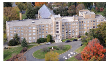
The Dominican Center, Mount Saint Mary College