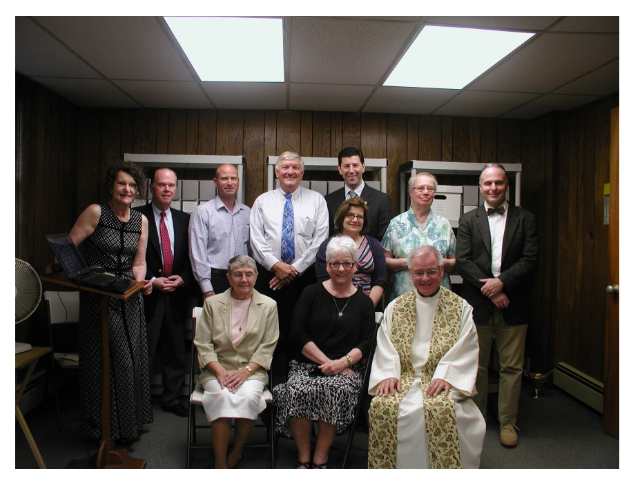
Church of the Sacred Heart, South Plainfield, official opening of parish archives, June 13, 2015

The Finding Aid for the archives is located on the parish website, <a href="www.churchofthesacredheart.net">www.churchofthesacredheart.net</a>. The opening displays were available for viewing during the months of June and July. Please contact Sr. Kathleen at 908-756-0633, ext. 142 to access the archives for research purposes.