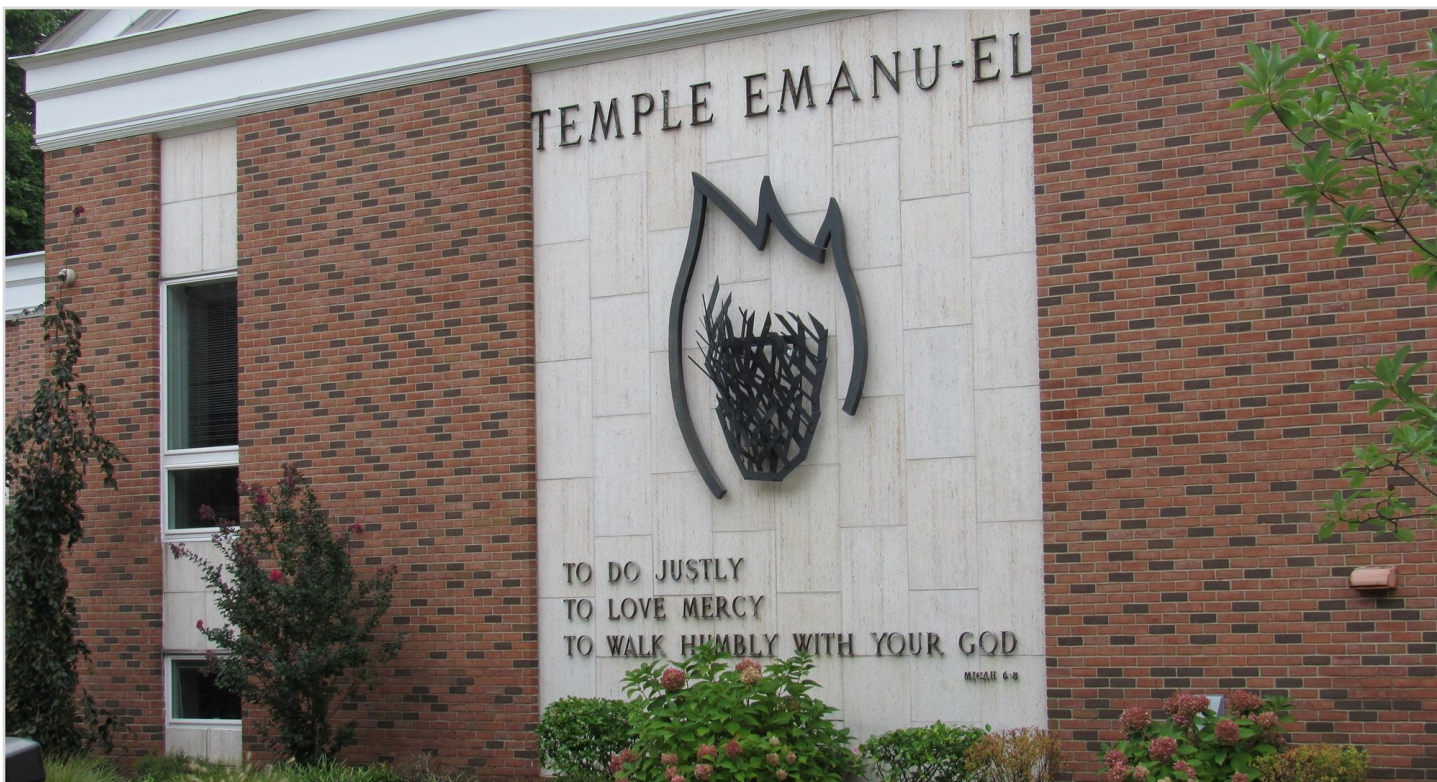
The Temple Emanu-El Synagogue (Reform) in Westfield, New Jersey