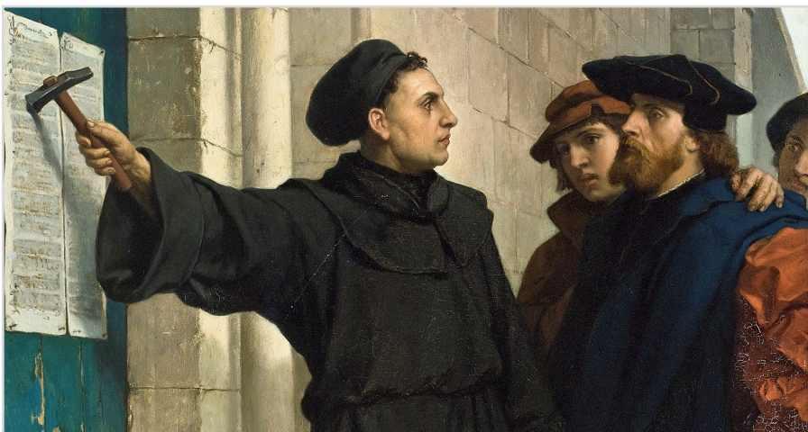
Martin Luther posting his "95 Theses" in 1517 by Ferdinand Pauwels (1830-1904)