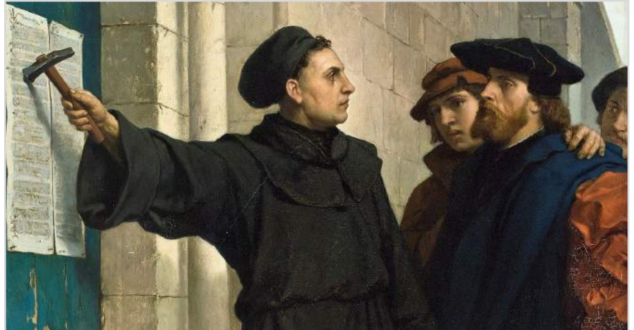
Martin Luther posting his "95 Theses" in 1517 by Ferdinand Pauwels (1830-1904)