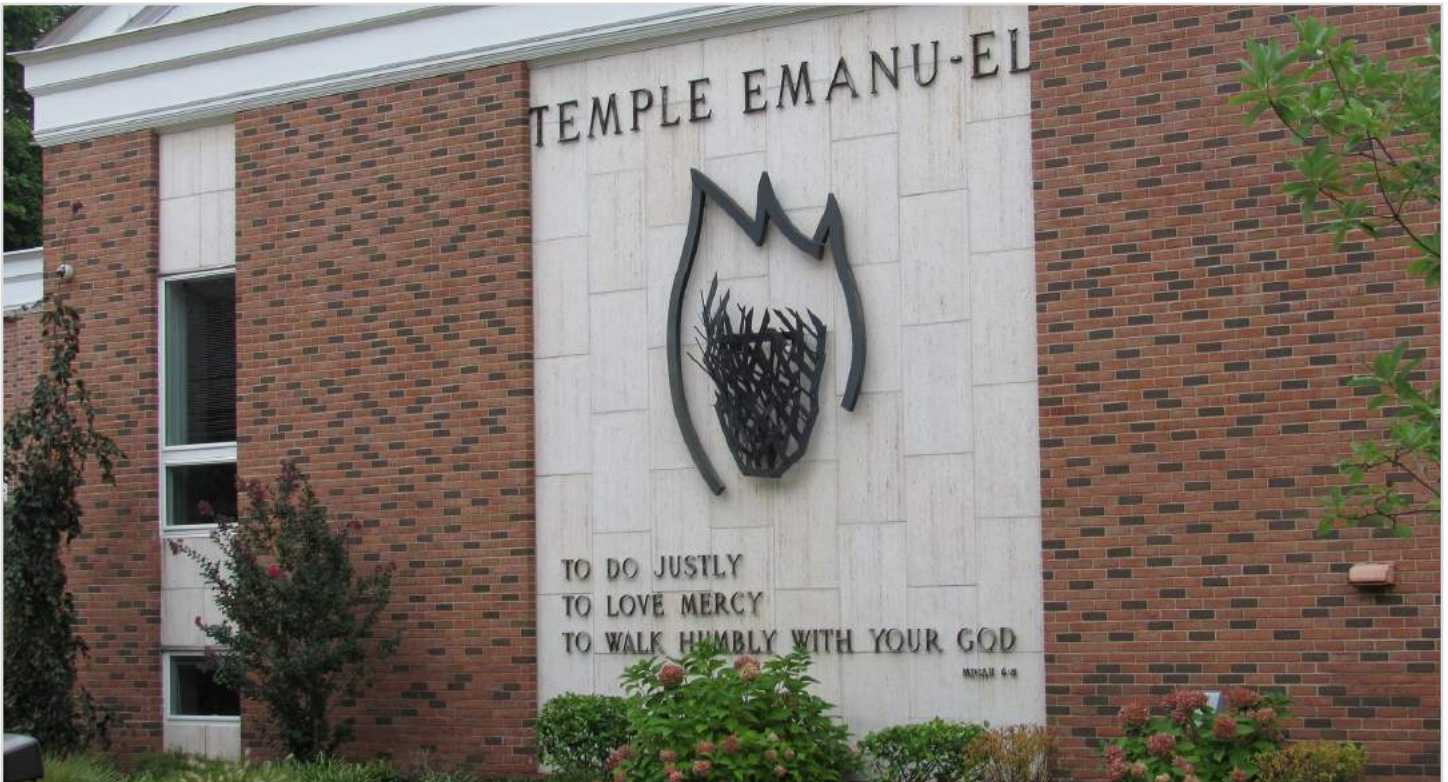
The Temple Emanu-El Synagogue (Reform) in Westfield, New Jersey